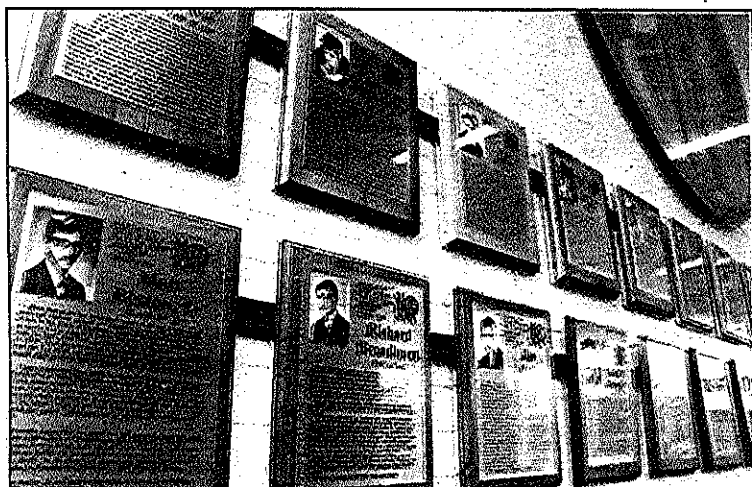
Honored alumni of MHS get a plaque with their accomplishments on a wall at the school.